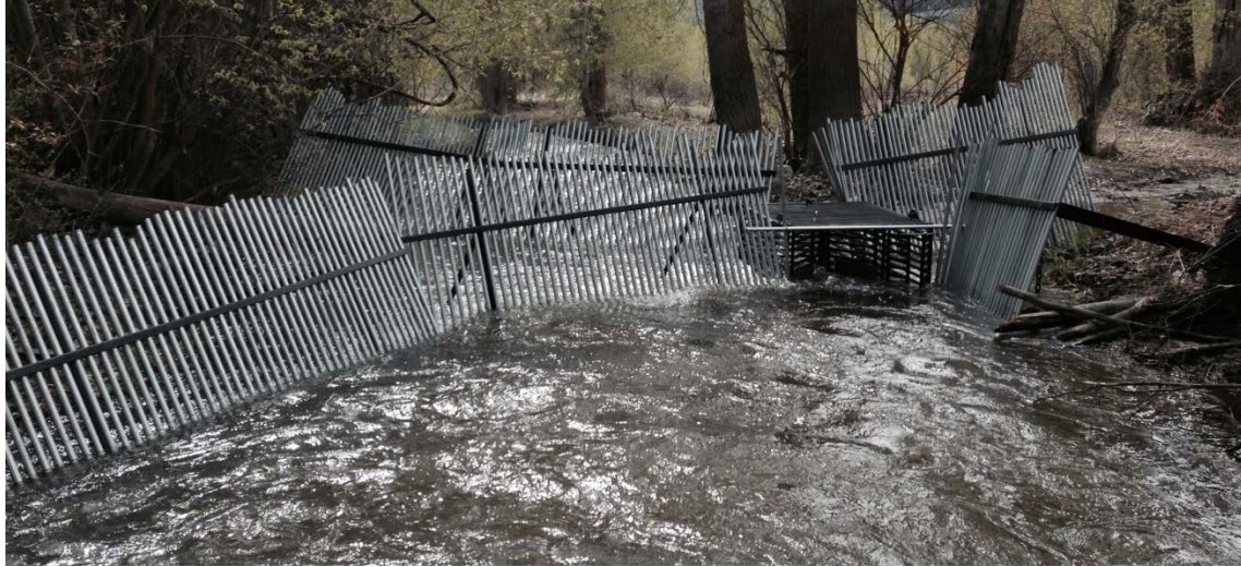
Figure 2.2 - Beaver Creek weir trap.