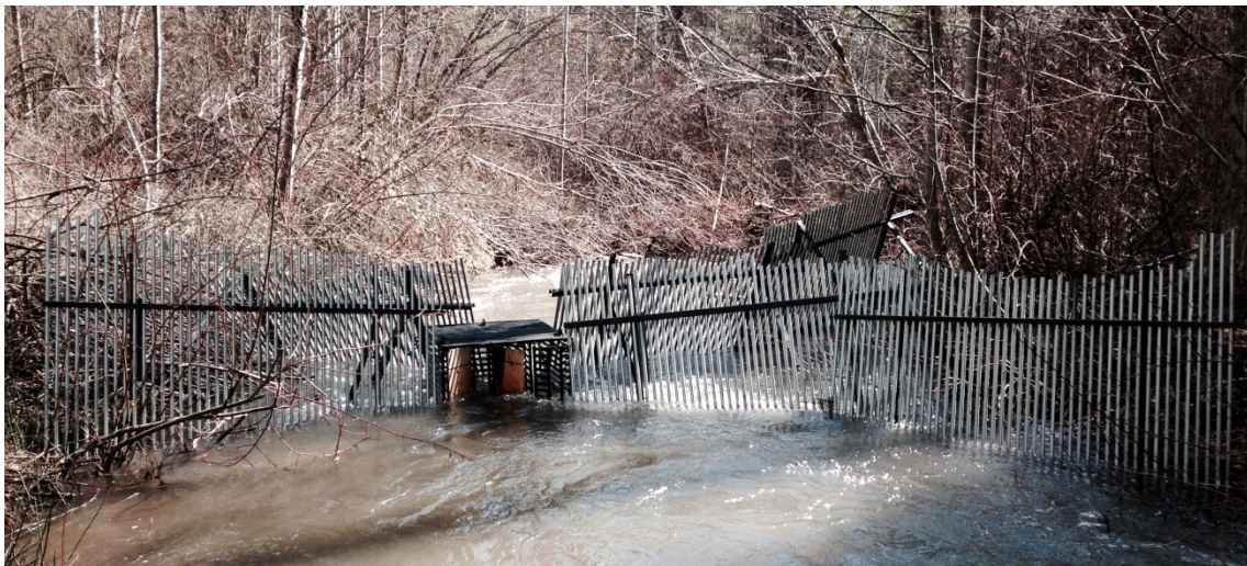
Figure 2.1 - Little Bridge Creek weir trap.

Weirs were to be operated in Little Bridge Creek (Figure 2.1) and Beaver Creek (Figure 2.2) in 2018. The weir on Little Bridge Creek was located 0.15 river miles from the confluence with the Twisp River. At this point, reduced gradient creates a wide pool area where water velocity is diminished. The site was accessed from a small two-track road off of National Forest Development Road 4415. The weir on Beaver Creek was located 0.15 river miles from the confluence with the Methow River.