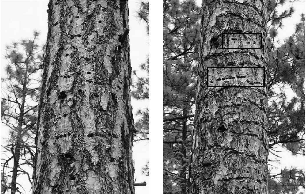
FIGURE 1. White-headed Woodpecker sap wells in Ponderosa Pine trees along the east-slope of the Cascade Range, Yakima County, Washington, 2008: left) recently excavated in rows and single exploratory holes; and right) recently excavated rows (solid boxes) among old sap wells.

detail. In addition, sap feeding by White-headed Woodpeckers has yet to be described in Washington. In this study, I describe the characteristics of trees used by White-headed Woodpeckers for sap feeding and comment on observations of sap feeding behavior along the east-slope of the Cascade Range, Yakima County, Washington. Information on the use of tree sap as a food resource by White-headed Woodpeckers will add to our understanding of the natural history of this species, much of which remains unknown (Garrett and others 1996).