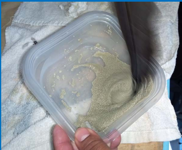
Lamprey spawning at Prosser Hatchery, 4/25/2012