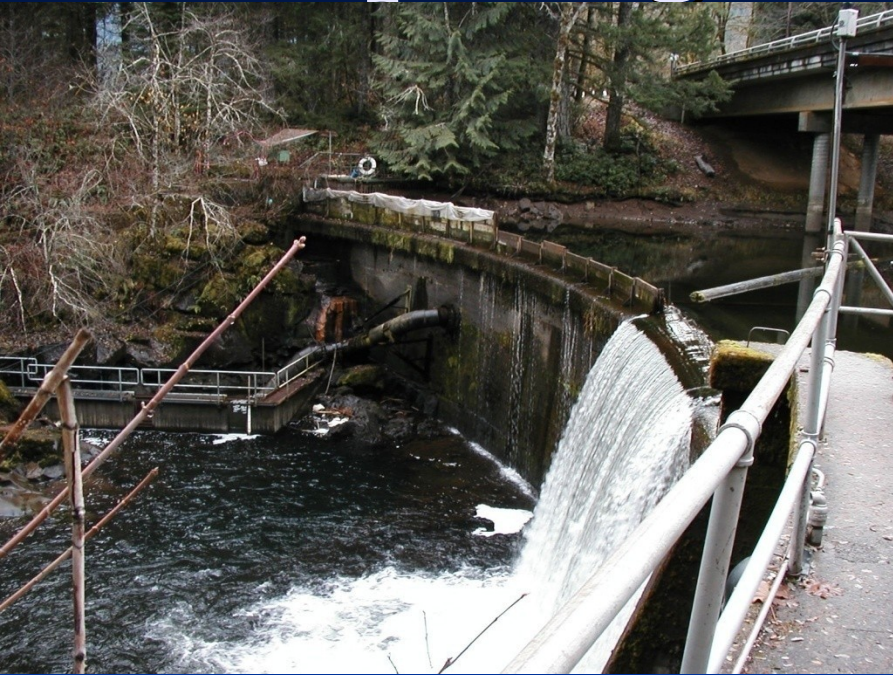
Hemlock Dam, Trout Creek