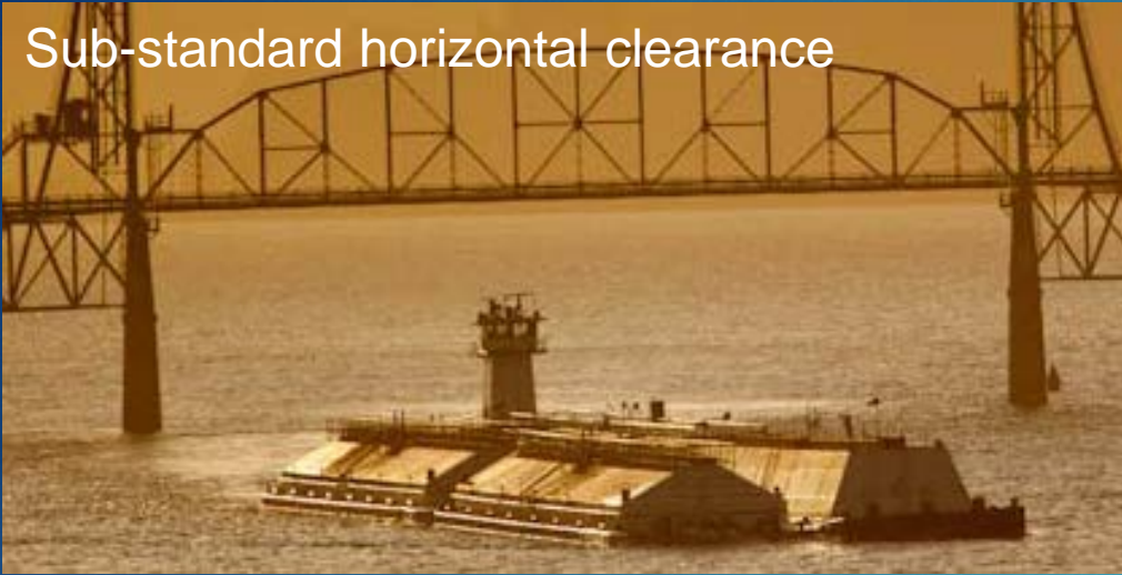
Sub-standard horizontal clearance