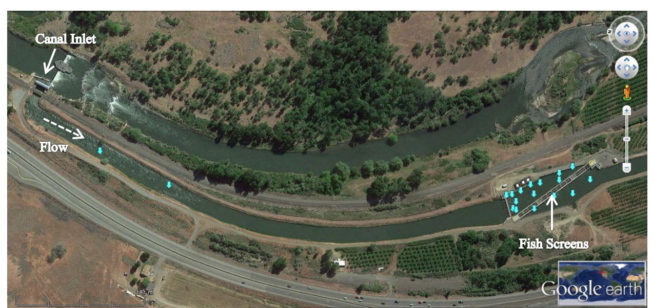
Map 3. An overview map of Wapato Diversion showing key locations (white arrows) and primary survey locations (blue arrows).

Wapato Diversion; Lower Yakima River (River km: 176.3)