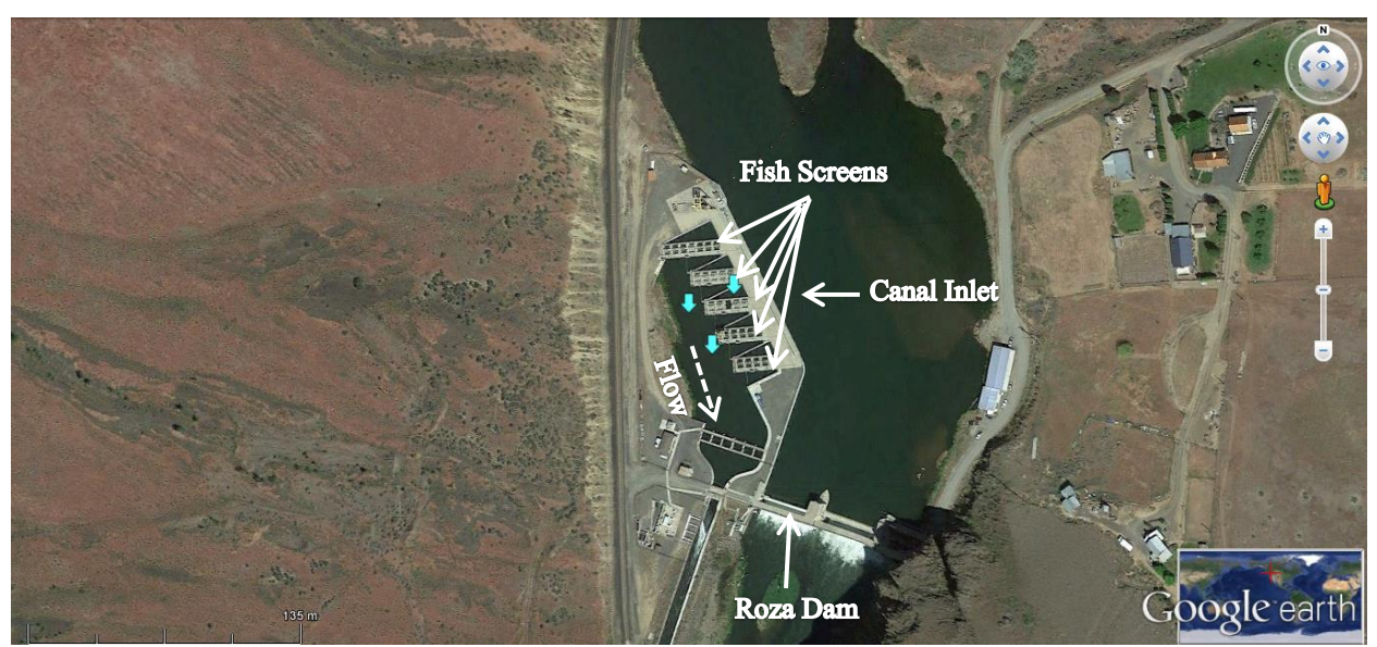
Map 5. An overview map of Roza Diversion showing key locations (white arrows) and primary survey locations (blue arrows).

Roza Diversion; Upper Yakima River (River km: 210.6)