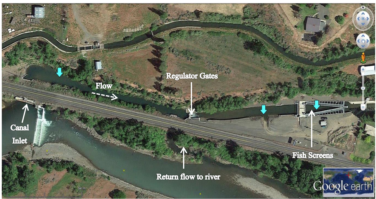
Map 11. An overview map of Wapatox Diversion showing key locations (white arrows) and primary survey locations (blue arrows).