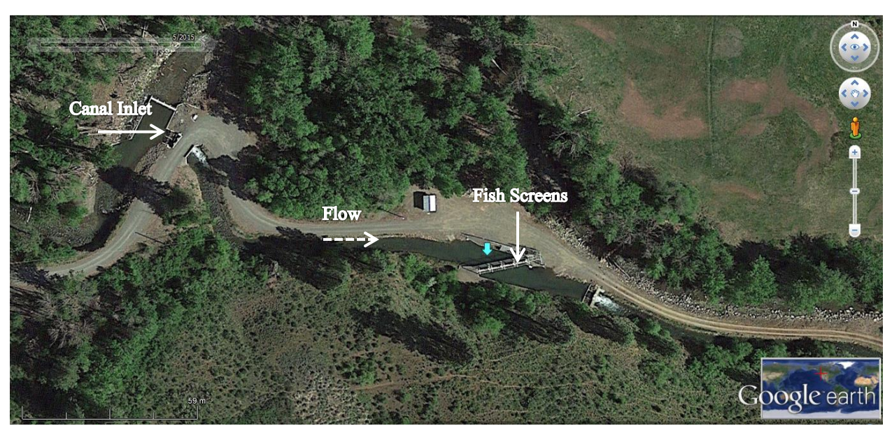
Map 9. An overview map of Taneum Diversion showing key locations (white arrows) and primary survey location (blue arrow).