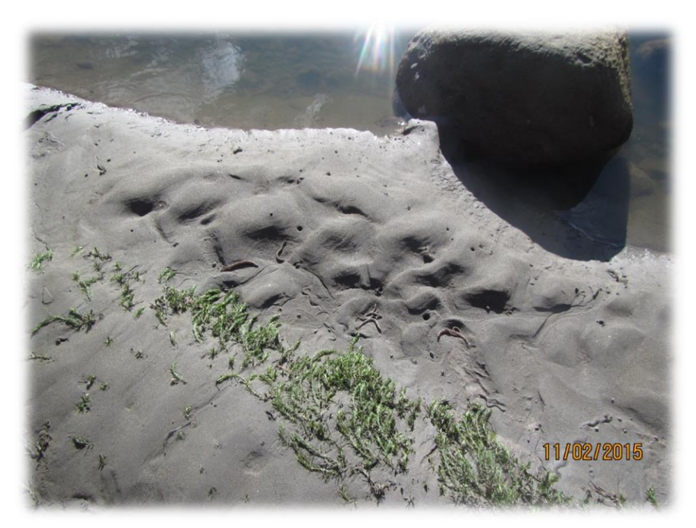
Cover Photo: Larval lampreys trapped on the dry bank after dewatering at Wapatox Diversion, Naches River.

2015 Summary Assessment of Larval/Juvenile Lamprey Entrainment in Irrigation Diversions within the Yakima Subbasin