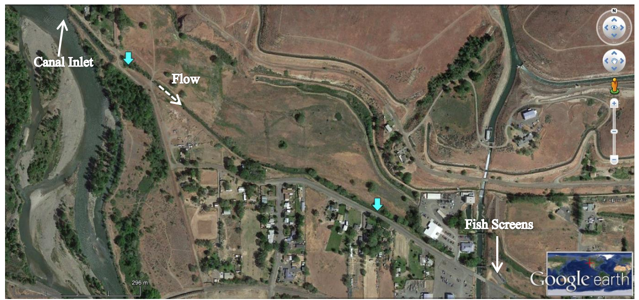
Map 4. An overview map of Union Gap Diversion showing key locations (white arrows) and primary survey locations (blue arrows).

Union Gap Diversion; Lower Yakima River (River km: 188.7)