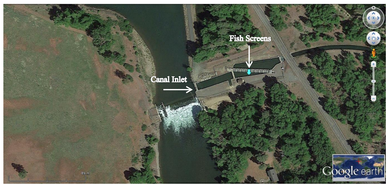
Map 6. An overview map of Town Diversion showing key locations (white arrows) and primary survey location (blue arrow).