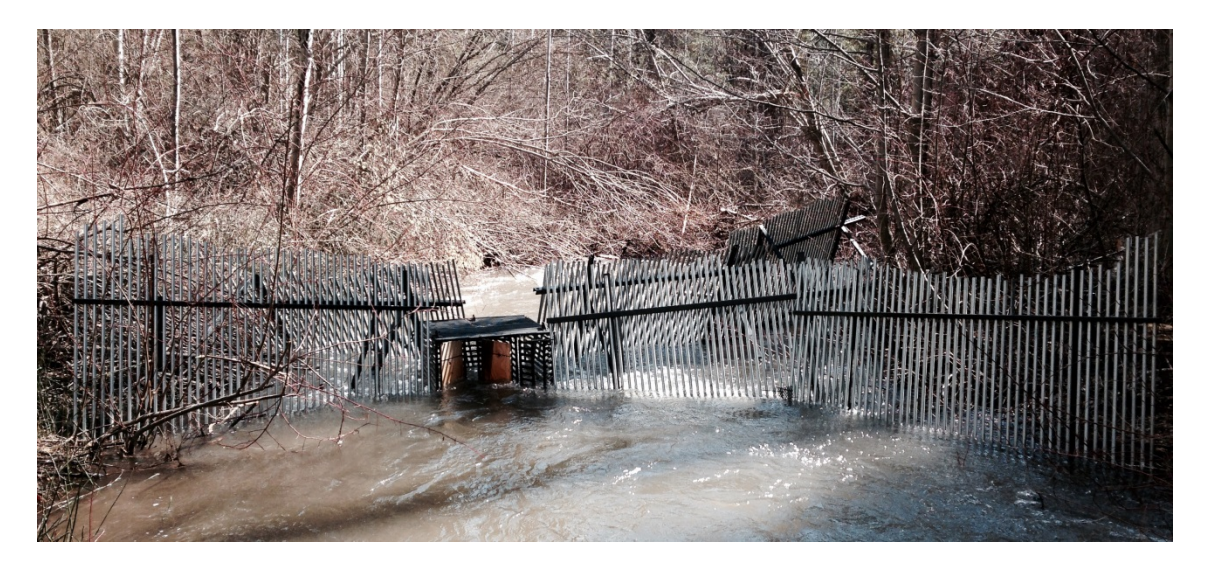
Figure 2.1 - Little Bridge Creek weir trap.

Weirs were to be operated in Little Bridge Creek (Figure 2.1) and Beaver Creek (Figure 2.2) in 2018. The weir on Little Bridge Creek was located 0.15 river miles from the confluence with the Twisp River. At this point, reduced gradient creates a wide pool area where water velocity is diminished. The site was accessed from a small two-track road off of National Forest Development Road 4415. The weir on Beaver Creek was located 0.15 river miles from the confluence with the Methow River.