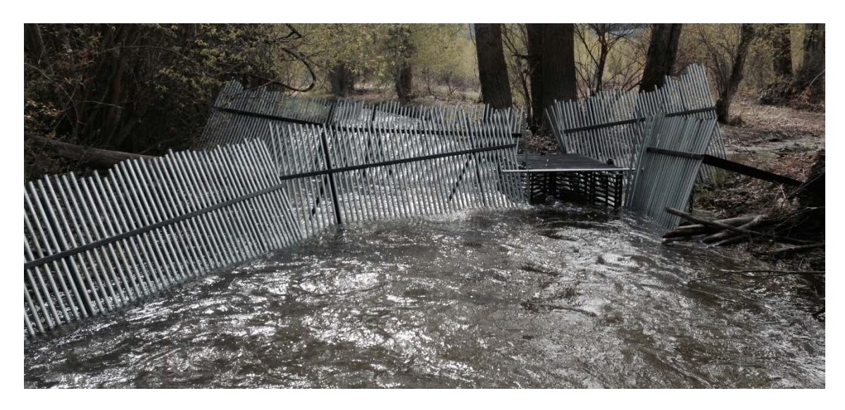
Figure 2.2 - Beaver Creek weir trap.