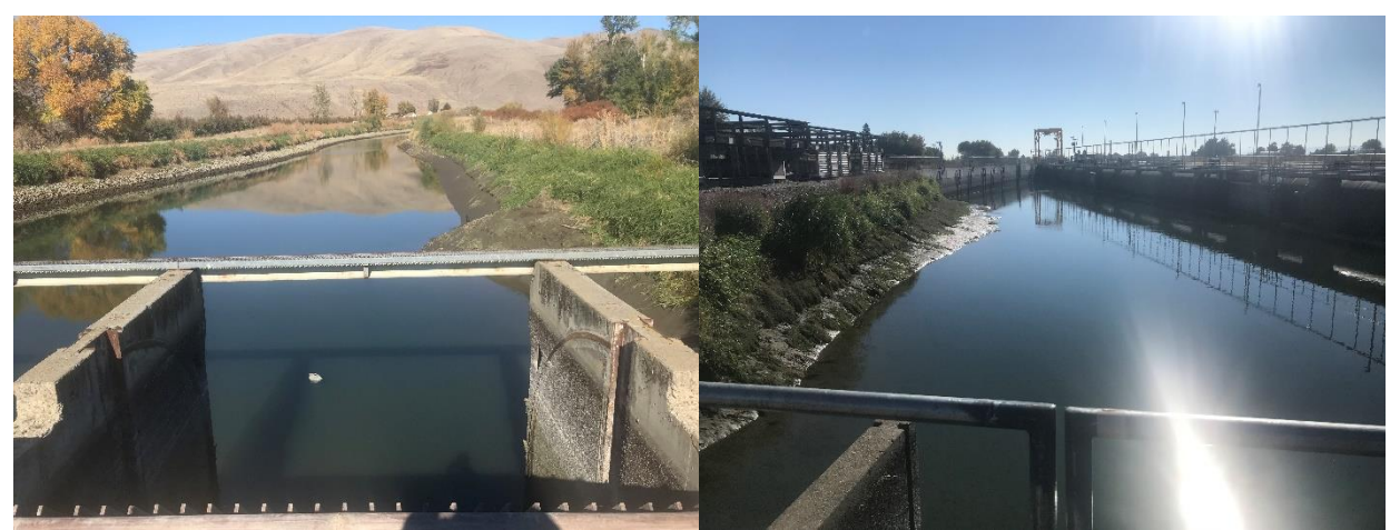
Figure 3. Overview of the upstream area above the trash racks (right) and the upstream area below the trash racks (left) taken October 17, 2018.