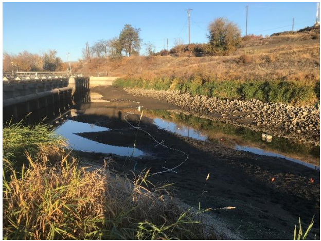
Figure 2. Overview of downstream area of the drum screens after dewatering at Sunnyside diversion on November 8, 2018.