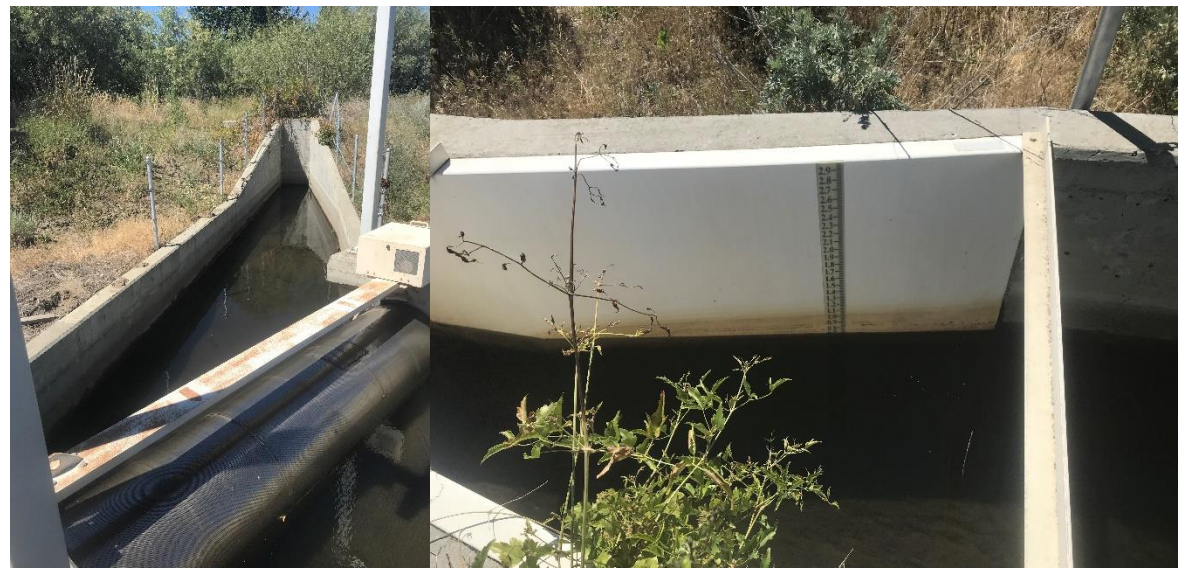
Figure 6. Overview of below the drum screen (right) and the water gauge (left) from Diversion 14 on Ahtanum Creek, taken July 3, 2018.