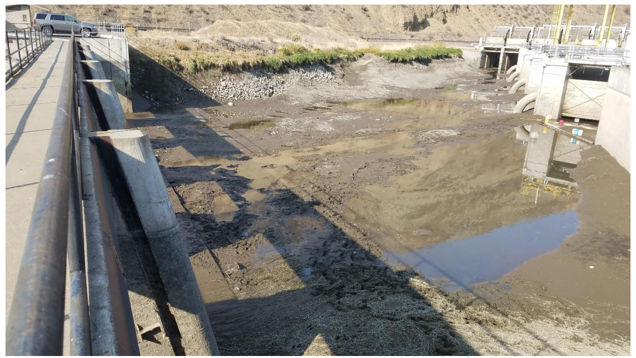
Figure 13. Overview of the isolated pools that were sampled below the screens at the Roza Diversion, taken October 23, 2018.