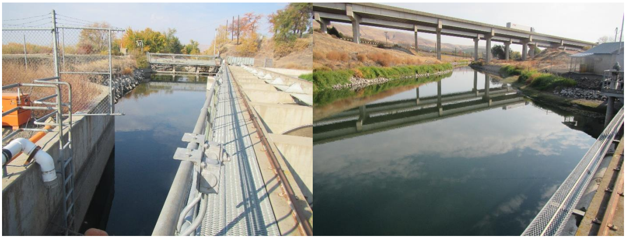
Figure 1. Overview of downstream area of the drum screens (right), and upstream of the drum screens (left) before dewatering at Sunnyside diversion on October 23, 2018.