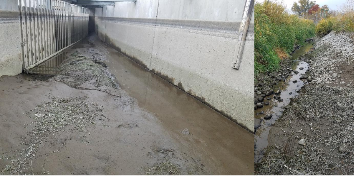
Figure 15. Overview of below the screens (right) and looking down the canal (left) of the New Cascade Diversion on the Yakima River, taken on October 23, 2018.