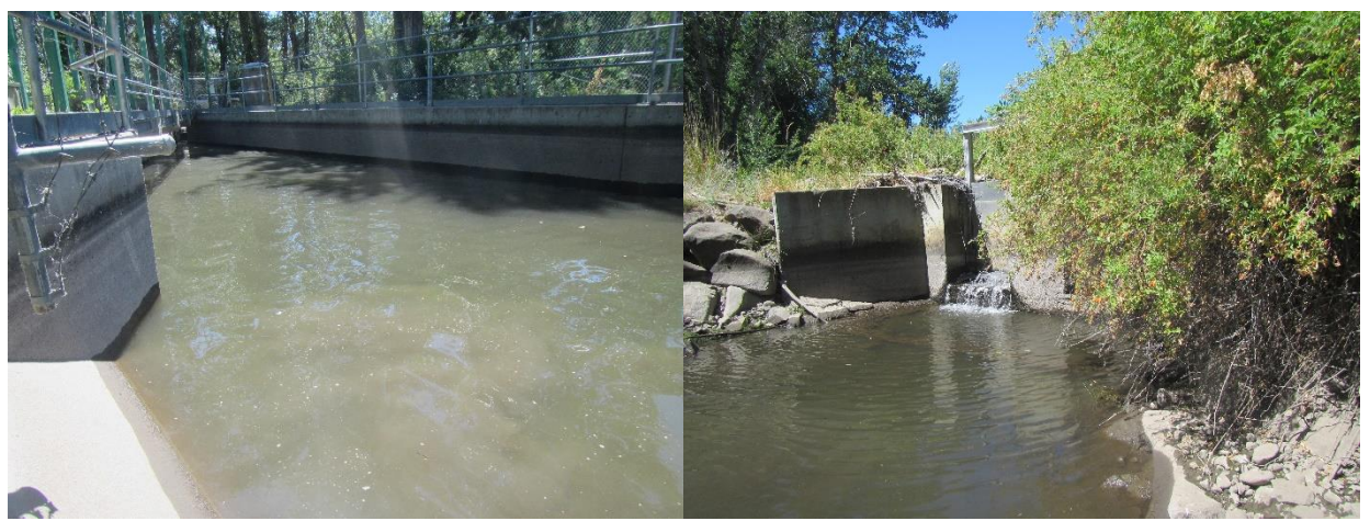
Figure 7. Overview of above the drum screens (right) and the closed headgate that feeds the canal (left) at the Bachelor-Hatton Diversion on Ahtanum Creek, taken July 19, 2018.