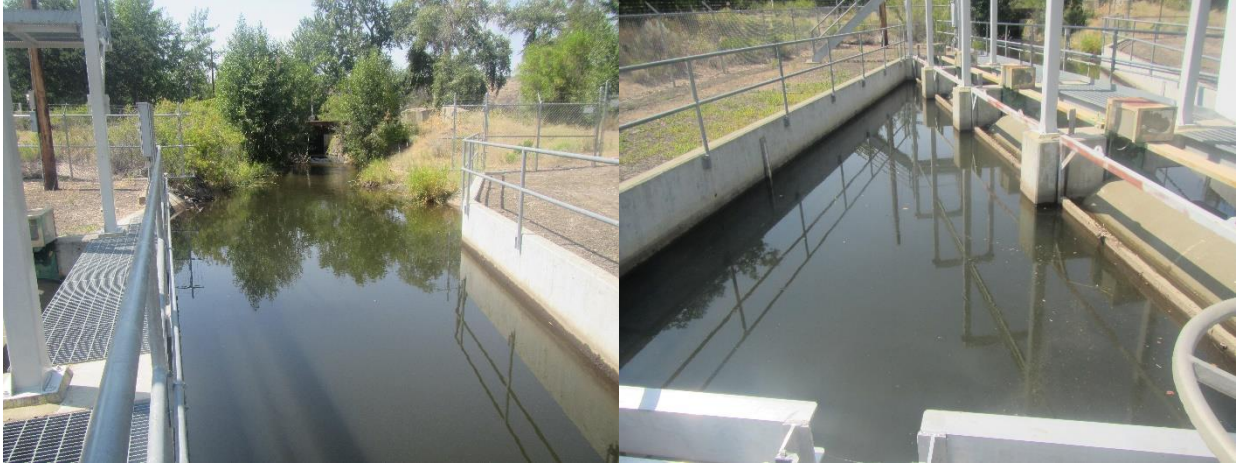
Figure 8. Overview of above the drum screens (right) and an overview of below the drum screens (left) at the Upper WIP Diversion on Ahtanum Creek, taken July 31,2018.