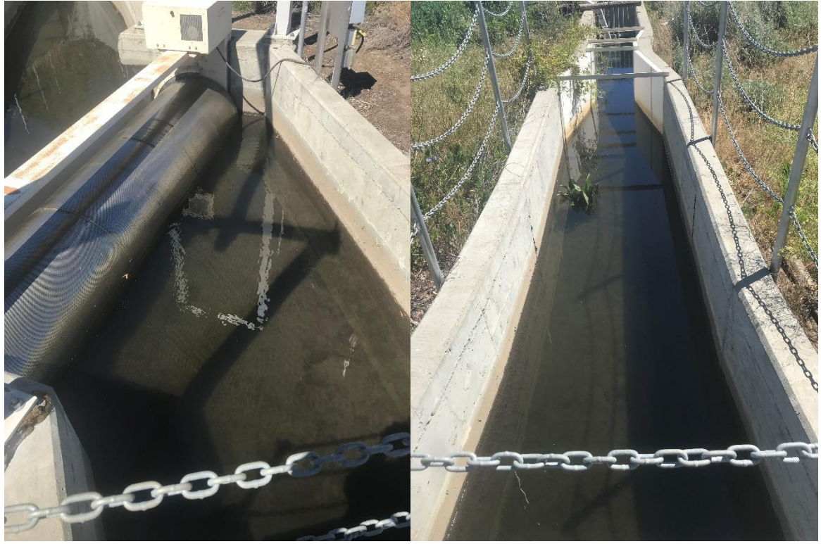
Figure 5. Overview of above the drum screen directly by the screen (right) and the upstream section that tapers into the canal (left) from Diversion 14 on Ahtanum Creek, taken on July 3, 2018.