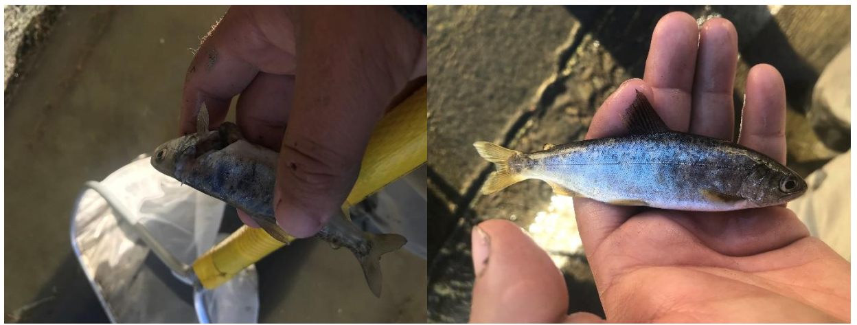
Figure 12. Deceased juvenile Chinook Salmon, one with signs of predation (right) and one without (left) from the Selah-Moxee Diversion on the Yakima River, taken October 16, 2018.