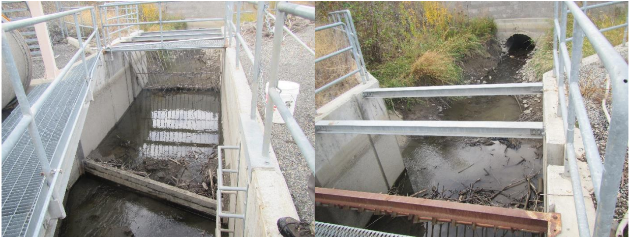
Figure 9. Overview of above the screens, below the trash racks (right) and an overview of above the screens, above the trash racks of the City of Yakima Diversion on the Naches River, taken November 1, 2018.