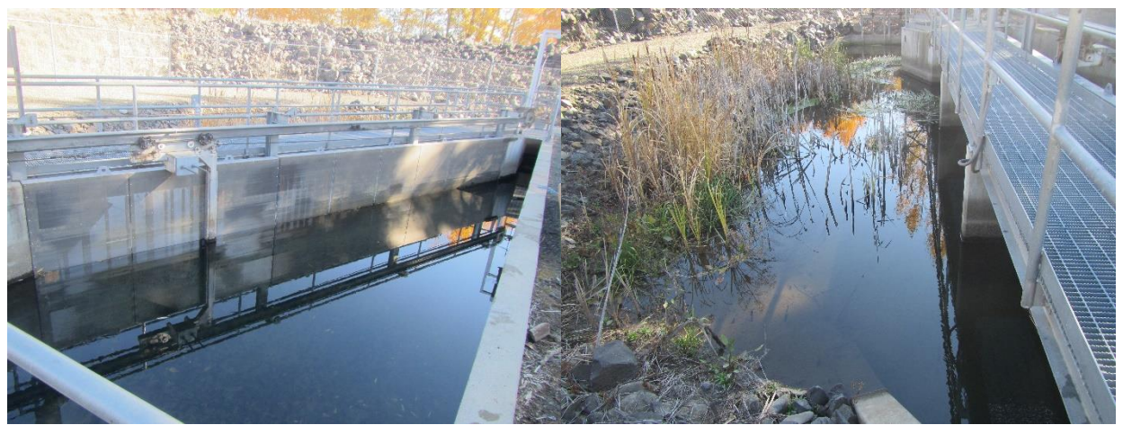
Figure 14. Overview of above the screens, below the trash racks (right) and overview of below the screens at the Ellensburg Mill Diversion on the Yakima River before dewatering, taken October 23, 2018.