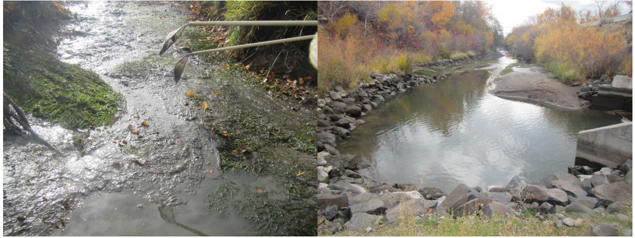
Figure 10. Close up of sampling area above the screens (right) and overview just below the head gate looking down the canal at Wapatox Diversion on the Naches River, take November 1, 2018.