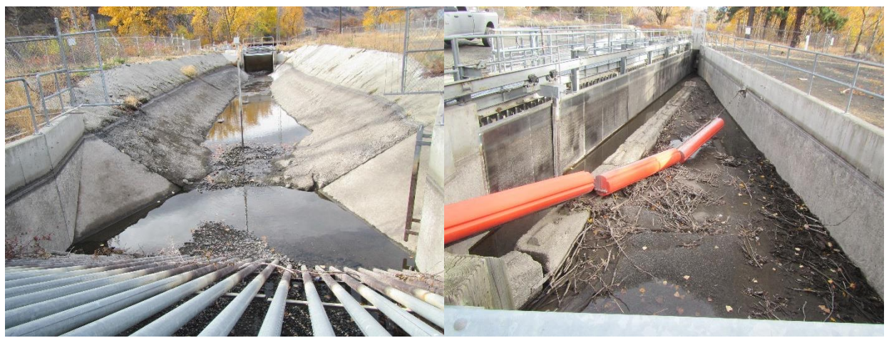
Figure 11. Overview of above the screens, above the trash racks (right) and overview of the dried sediment and isolated pools above the screens, below the trash racks (left) of the Naches-Selah Diversion on the Naches River, taken November 1, 2018.