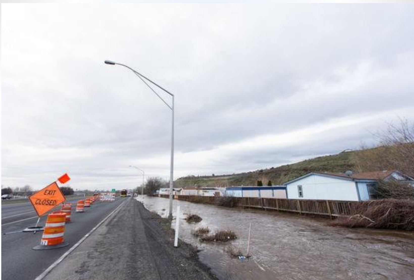
2017 Floods in Yakima