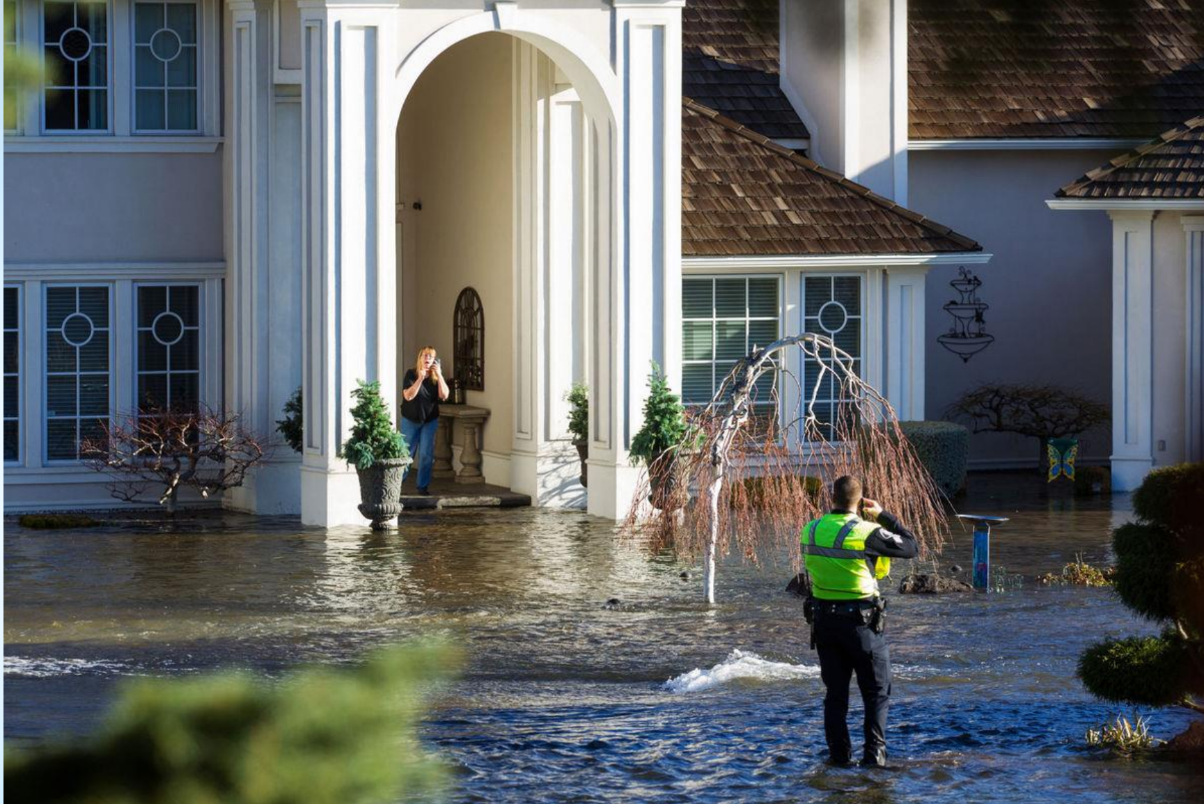
Lake Aspen Floods at 16 th Ave