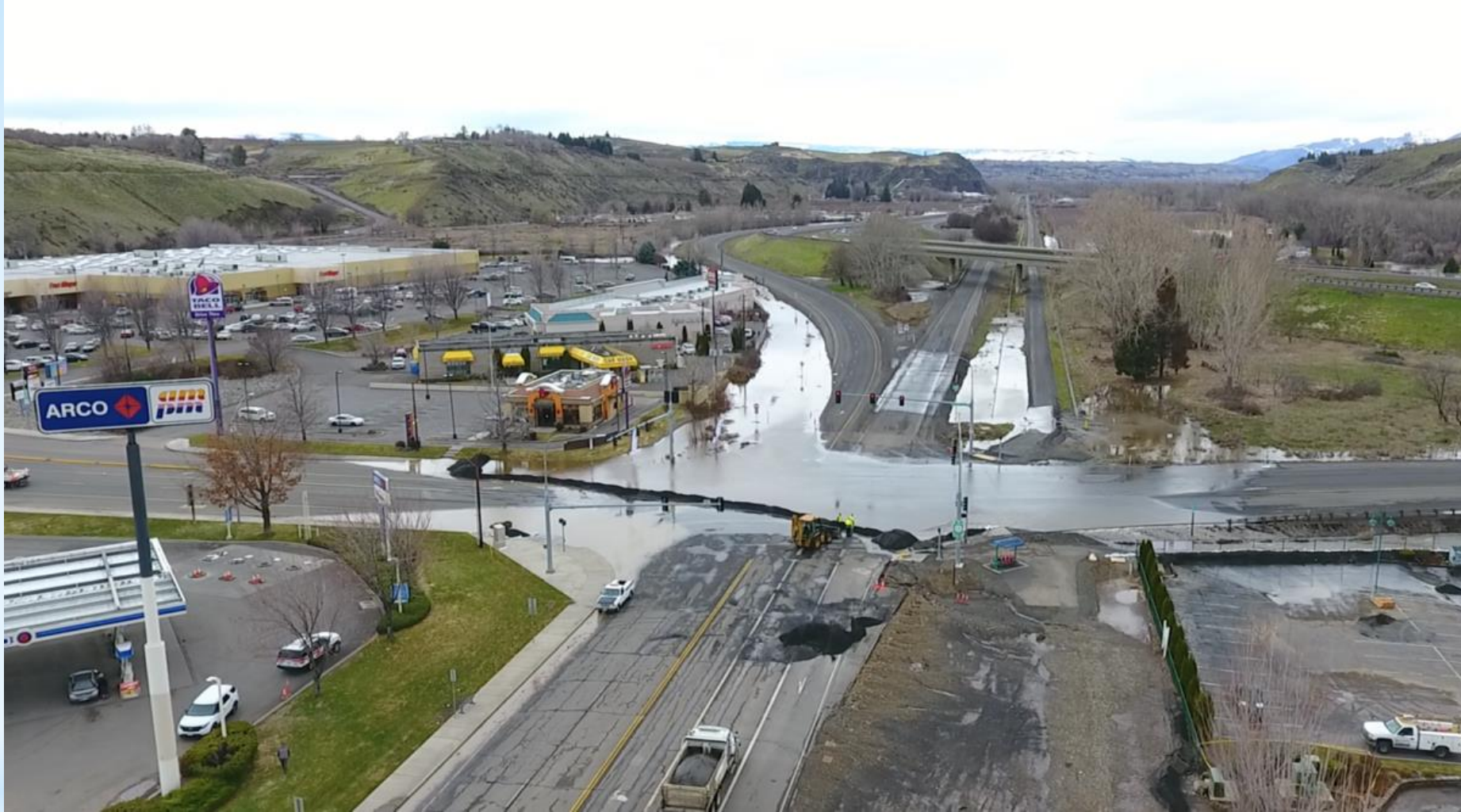
Naches River Floods At 40 th Avenue 2017