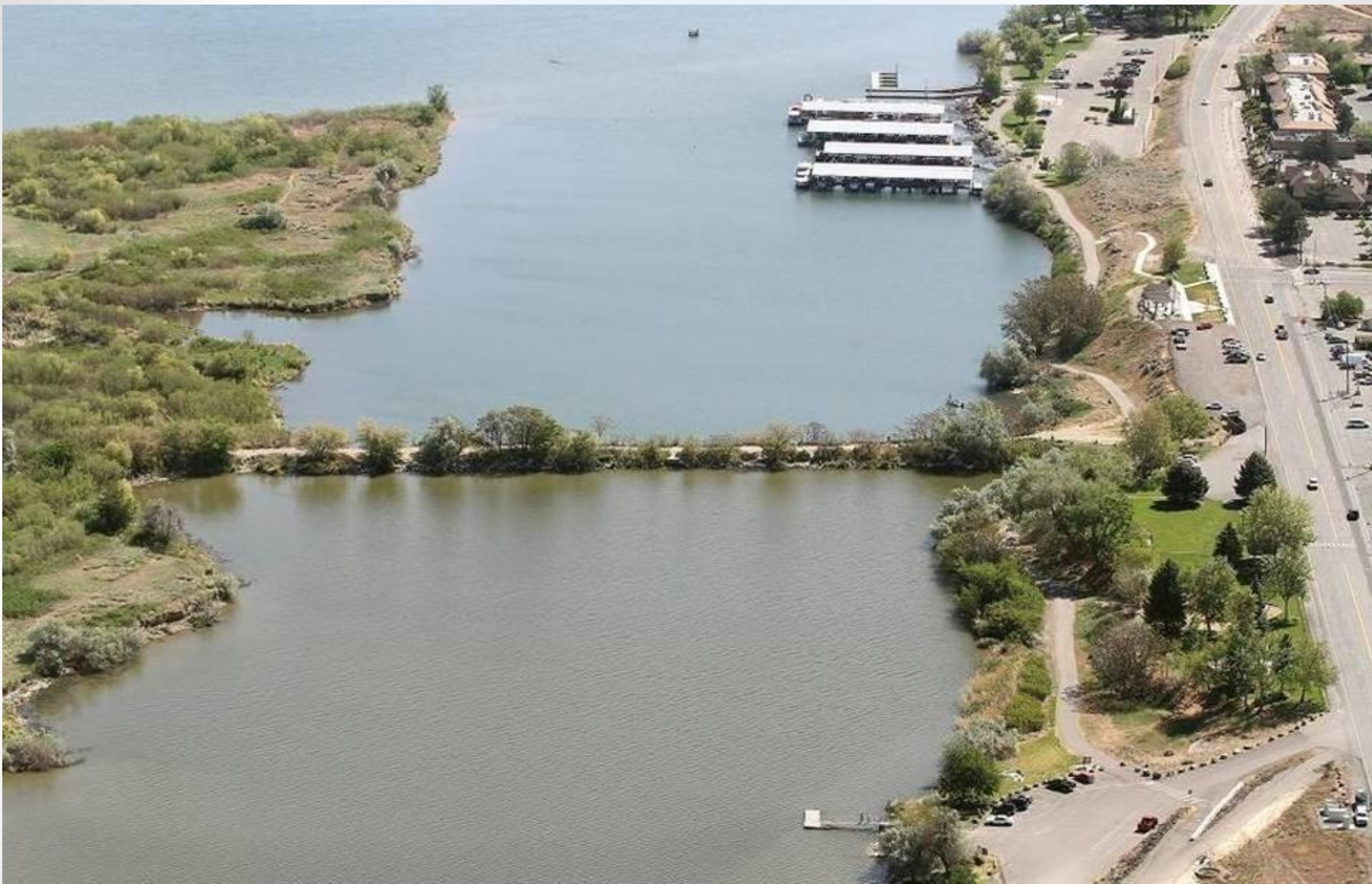
Bateman Island -- Science AND Management