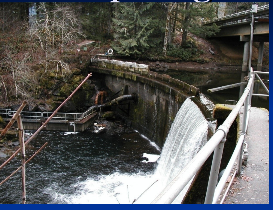
Hemlock Dam, Trout Creek