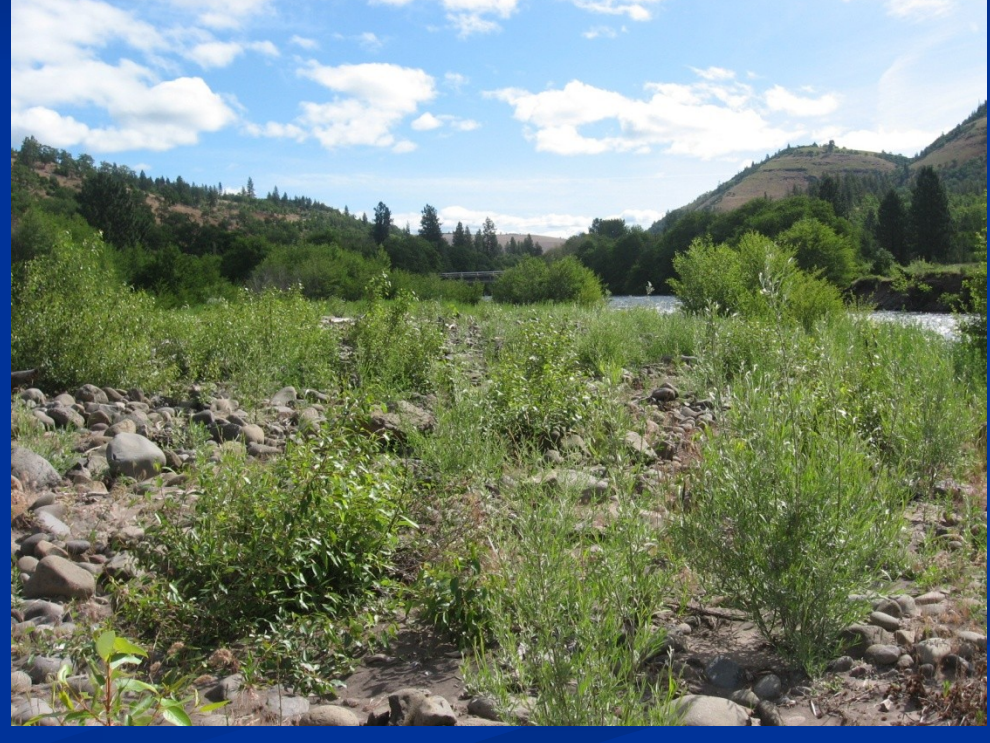
Planted with stinger, March 2006