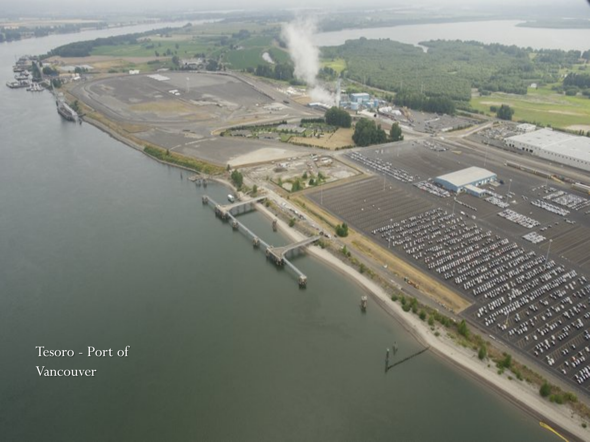
Tesoro - Port of Vancouver