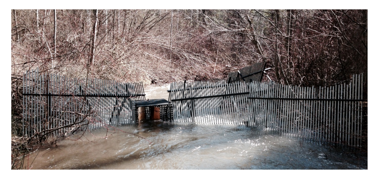
Figure 2.1 - Little Bridge Creek weir trap.

season we intended to place weirs in South Fork Gold Creek, Hancock Springs, and Libby Creek. A decision was made not to operate the weirs in South Fork Gold Creek and Hancock Spring due to personnel limitations. These weirs were had the fewest number of NOR steelhead encountered the previous trapping season. The Libby Creek weir site was deemed infeasible to install a weir on and will not be pursued in the future.