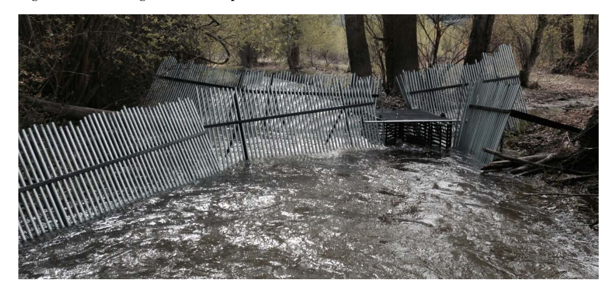
Figure 2.2 - Beaver Creek weir trap.